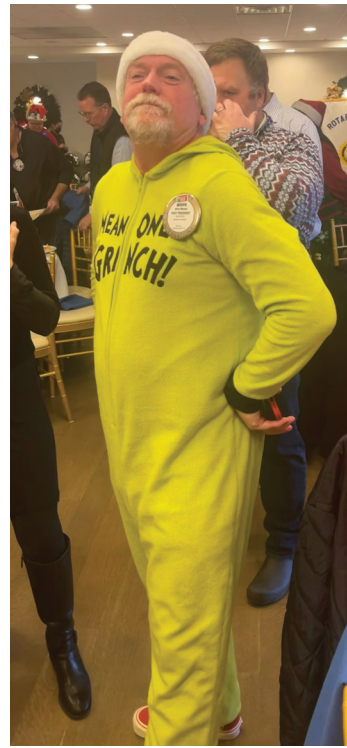
Did you really expect anything less?